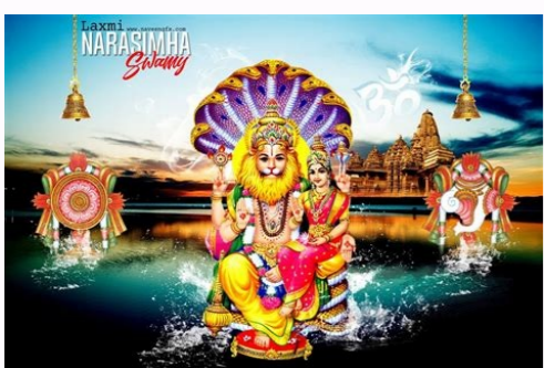
Lakshmi narasimha swamy hd wallpapers free download. Narasimha swamy wallpapers free download.